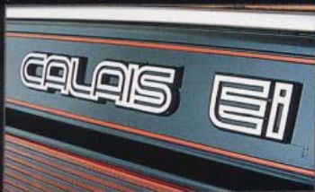
Electronic injection 3.3-litre engine.

Inside new Calais lies a world of innovation. At a touch, high fidelity stereo music will